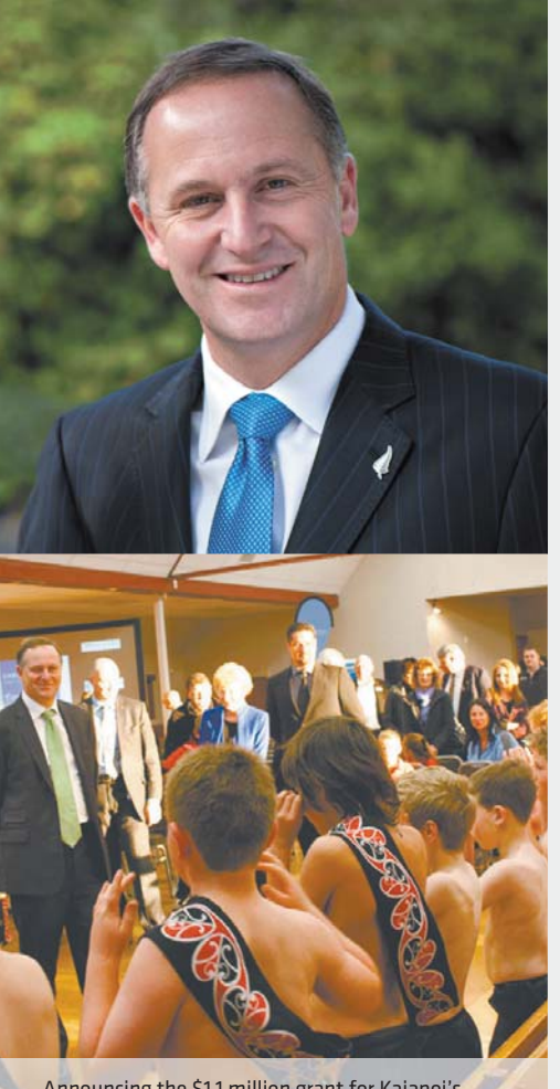
Announcing the $1.1 million grant for Kaiapoi's Aquatic Centre