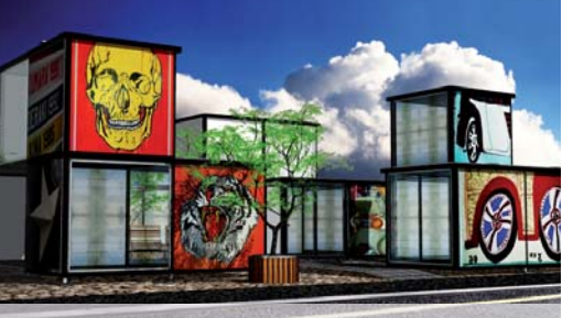
Modular Artboxes and Beatbox